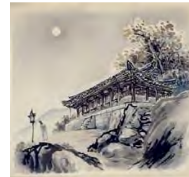
'Moonlight' by Korean artist Ki Chang Kim