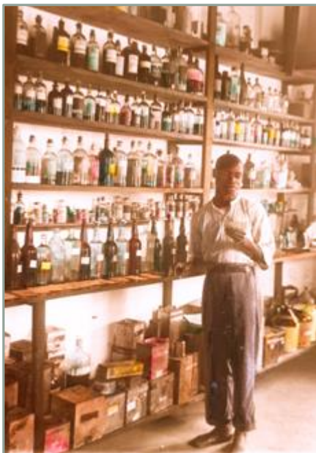
Compounder in the medical dispensary, Ilesha MMS Hospital, Osun, Nigeria

The Mundus Gateway to Missionary Collections enables researchers to locate the archives of missionary societies across the UK. To search the database go to http://www.mundus.ac.uk . A regional search using the 'maps' facility will help in narrowing down those collections held at SOAS and other institutions that relate specifically to Africa, or regions within Africa.