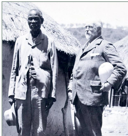
Khama III, Chief of the Bamangwato and Sir Albert Spicer, London Missionary Society Treasurer, in Serowe, Bechuanaland Protectorate [Botswana], 1907

SOAS Library holds an estimated 750,000 original documents, some 70,000 photographs and many thousands of published works comprising histories, memoirs, annual reports, missionary magazines, bible translations and hymnals.