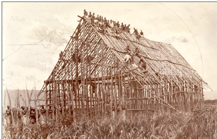
Building the first church in the Liendwe Valley, Northern Rhodesia [Zambia], c.1900.