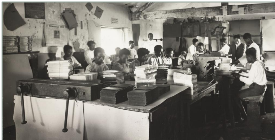
The London Missionary Society printing press, Antananarivo, Madagascar, c.1930

In addition to histories, biographies, reports and periodicals of the societies, they contain material on all aspects of Christian mission in addition to the geography, history, natural history, anthropology, religion, philosophy, language, literature, science and medicine of the peoples with whom the missionaries were in contact.