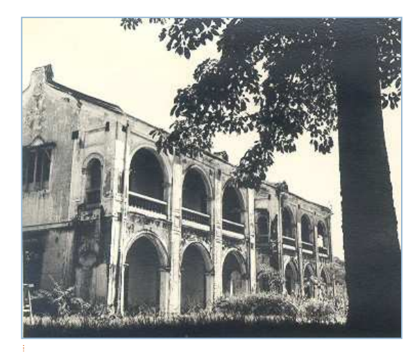
Private Ward Block, Swatow Mission Hospital (PCE/FMC I Additonal/109)