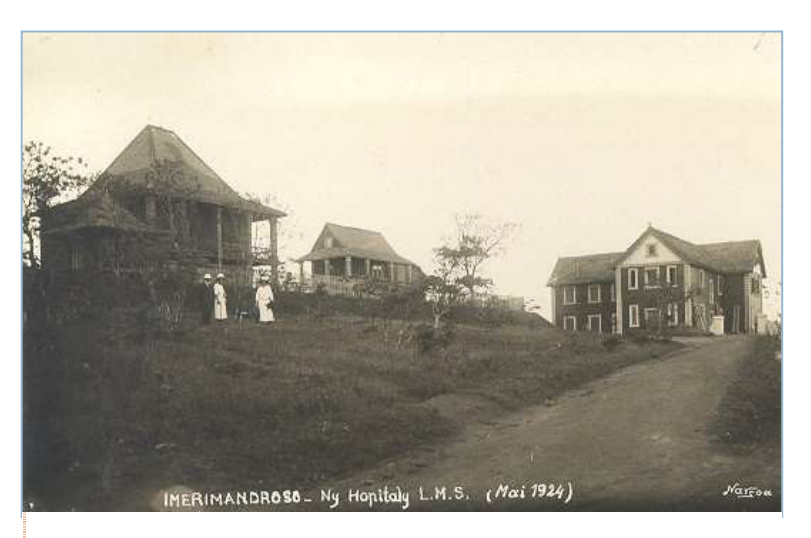
Imerimandroso Hospital

the leper colony at Mangarono near Antsirabe, and circumcision ceremonies.