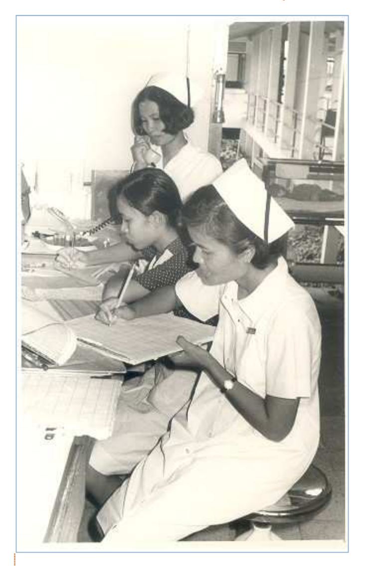
Nong Bua Hospital Nurses' Office, Thailand

This section also contains a file of twenty leaflets, dating from the twentieth century, regarding the medical work of the CIM. These includes descriptions of hospitals, for example the Paoning Hospital, Szechuan (1941-1946), and advice to potential medical missionaries.