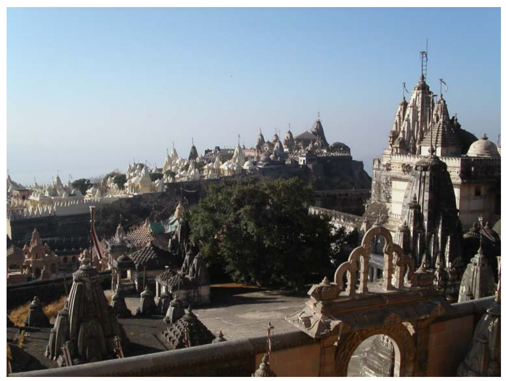
Plate 1. General View of Śatruñjaya, with main Ādīśvara Temple in the background