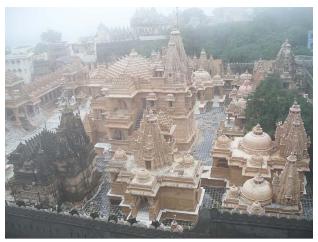
Plate 2. Motīśāh's Ṭumk, from the northern summit