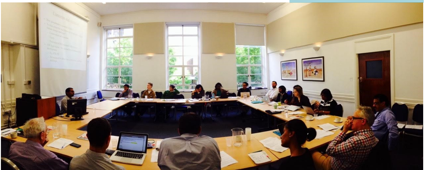
Workshop on Climate Change and Groundwater: Law and Policy Perspectives, SOAS, 29-30 May 2015 (see page 8 for details).